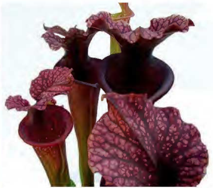
Figure 6: Sarracenia 'Vintner's Treasure'.

back to the front. The fluted mouth attains comparable sizing with the hood and has a very smooth and glossy appearance.